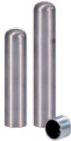
4" Diameter Bollard Height 24" Stainless Steel HSB4.0-24DB