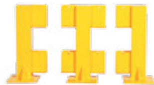
Box Rail 20 Left Hand Post