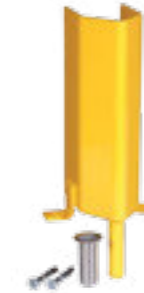
Pallet Rack Pro 12"