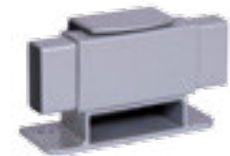
Box Rail 7 Middle Bracket Galvanized