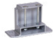
Box Rail 7 Standard Bracket Galvanized