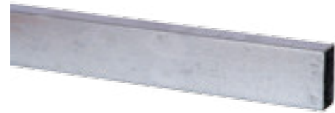
Box Rail 7 Galvanized Rail