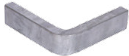
Box Rail 7 90° Corner Galvanized